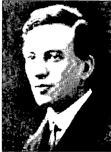
Arnold J Toynbee.

Arnold Joseph Toynbee (1889-1975) was an academic historian and the nephew of Arnold Toynbee, the political economist and social reformer. He began his teaching career at Oxford in 1912. Though he did not share Bryce's enthusiasm for Armenia, he was well versed in the Balkans and the Near East and had a particular expertise in Greek